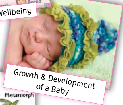
Growth & Development of a Baby