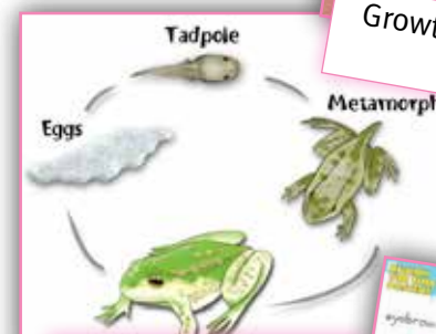
Life Cycles in Science