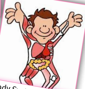
Body Systems Science